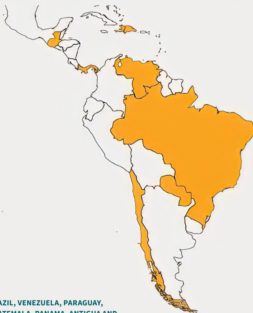
BRAZIL, VENEZUELA, PARAGUAY, GUATEMALA, PANAMA, ANTIGUA AND BARBUDA, DOMINICA AND CHILE

Although it represents a step forward compared to regulations where abortion is prohibited in all cases, this type of legislation presents a significant limitation to sexual and reproductive rights. In many cases, the risk to life can involve a limited interpretation on the risk of death, ignoring that different personal circumstances of women may be life-threatening for biological, psychological or social reasons. 16