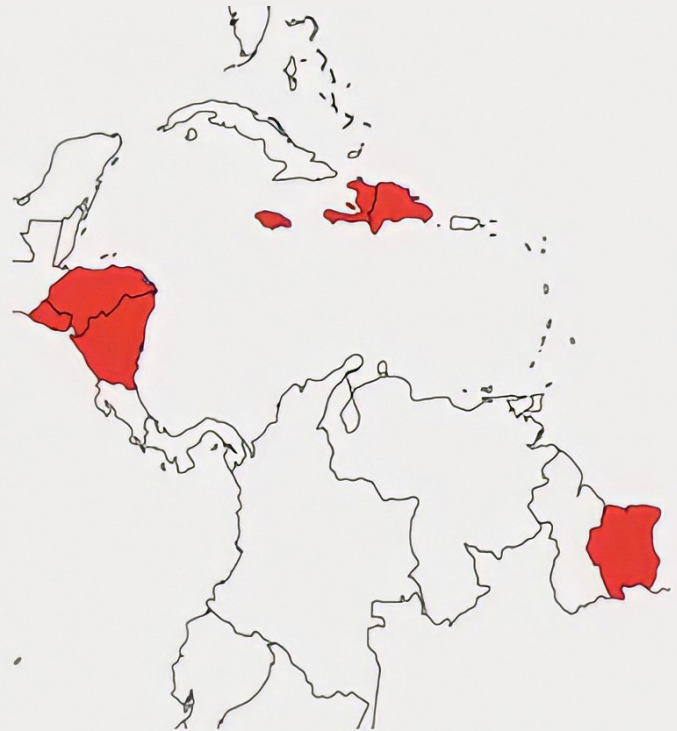
JAMAICA, HAITI, DOMINICAN REPUBLIC, EL SALVADOR, HONDURAS, NICARAGUA, SURINAME

Regulations that prohibit abortion in all cases disregard international human rights standards 13 on the matter and have serious impacts on the fundamental rights of women and people who can get pregnant who face greater risks of living in vulnerable conditions and undergoing unsafe abortions that seriously endanger their health and life. 14 Additionally, in some contexts, regulations lead people in charge of providing health services to be unaware of their duty to maintain professional confidentiality and report their patients. 15 In many cases, this also leads to the unjust criminalization of women who have experienced obstetric emergencies.