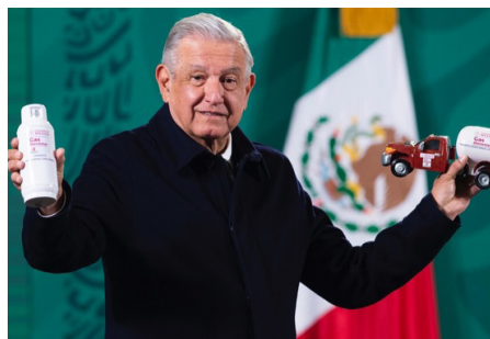
López Obrador

The U.S. government on Wednesday said it will allow Mexican state oil company Pemex to purchase Royal Dutch Shell's controlling interest in the Deer Park oil refinery in Texas, Reuters reported. Mexican President Andrés Manuel López Obrador told reporters that the decision from the Committee on Foreign Investment in the United States, or CFIUS, was "very good news" and thanked U.S. President Joe Biden for his support during the authoriza-