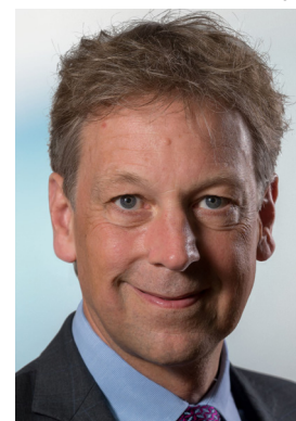
Stausholm // File Photo: Rio Tinto.