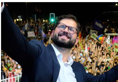
Boric

Gabriel Boric, 35, became the youngest person ever elected president of Chile in Sunday's runoff vote, La Tercera reported. He defeated José Antonio Kast, a far-right candidate, by a larger margin than most polls had predicted, with 56 percent of the vote as compared to 44 percent for Kast. A leftist congressman, Boric also became the most voted-for president in the history of the country, receiving 4.6 million votes, surpassing the 4 million that Eduardo Frei received in 1993. A key to his success was the ability to draw out new voters, according