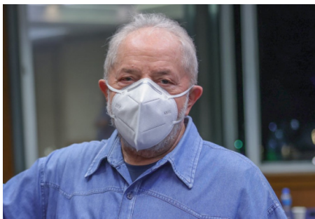
Lula

Former Brazilian President Luiz Inácio Lula da Silva could defeat current President Jair Bolsonaro in the first round if the country’s presidential election were held now, according to a new opinion poll, Reuters reported June 25. In the survey, 49 percent of respondents said they would vote for Lula, versus 23 percent for Bolsonaro. The poll, by Inteligência em Pesquisa e Consultoria (IPEC), was published June 25 in daily newspaper O Estado de S. Paulo. In