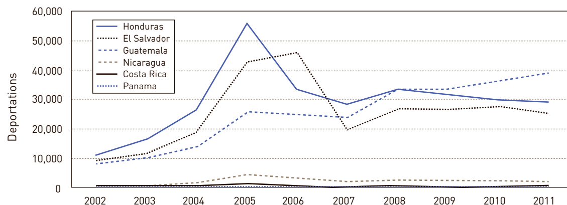
Graph 1. Deportations from the United States by Country of Origin, 2002–2011