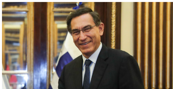
Peruvian President Martín Vizcarra is pushing an ambitious package of health care and other reforms.

Q Peru's government last month announced an ambitious social and economic reform package that includes injecting $270 million into the country's health care system. President Martín Vizcarra's administration will also try to push early next year to raise the minimum wage and pensions for state workers, new Prime Minister Vicente Zeballos said. Does Vizcarra have the right plan, and what other economic and social reforms need to be prioritized? Who will the proposed measures benefit the most? How will Vizcarra's recent dissolution of Congress, and legislative elections scheduled for January, affect the reforms' passage?