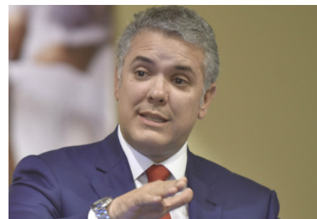
Duque

Colombian President Iván Duque on Dec. 5 said the country's electoral reforms must include a ban on financing political campaigns with cash, national news agency Colprensa reported. "It's important that in the reforms, we guarantee the end of cash management to finance campaigns," Duque said at an event