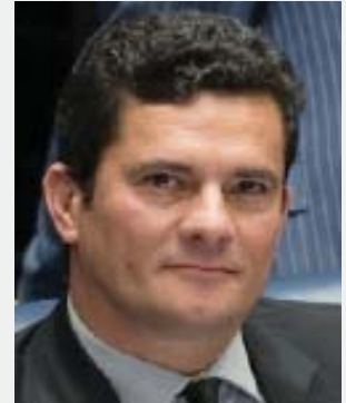
Moro

Federal judge Sérgio Moro on Nov. 1 accepted Brazilian President-elect Jair Bolsonaro's offer to become the next government's minister of justice. The appointment has caused controversy as Moro was in charge of the investigation into the massive "Lava Jato," or Car Wash, corruption scandal that resulted in the imprisonment of former President Luiz Inácio Lula da Silva in April. The decision ultimately barred Lula, who led in the polls, from running for president against Bolsonaro in the October election. The incoming administration takes office Jan. 1.